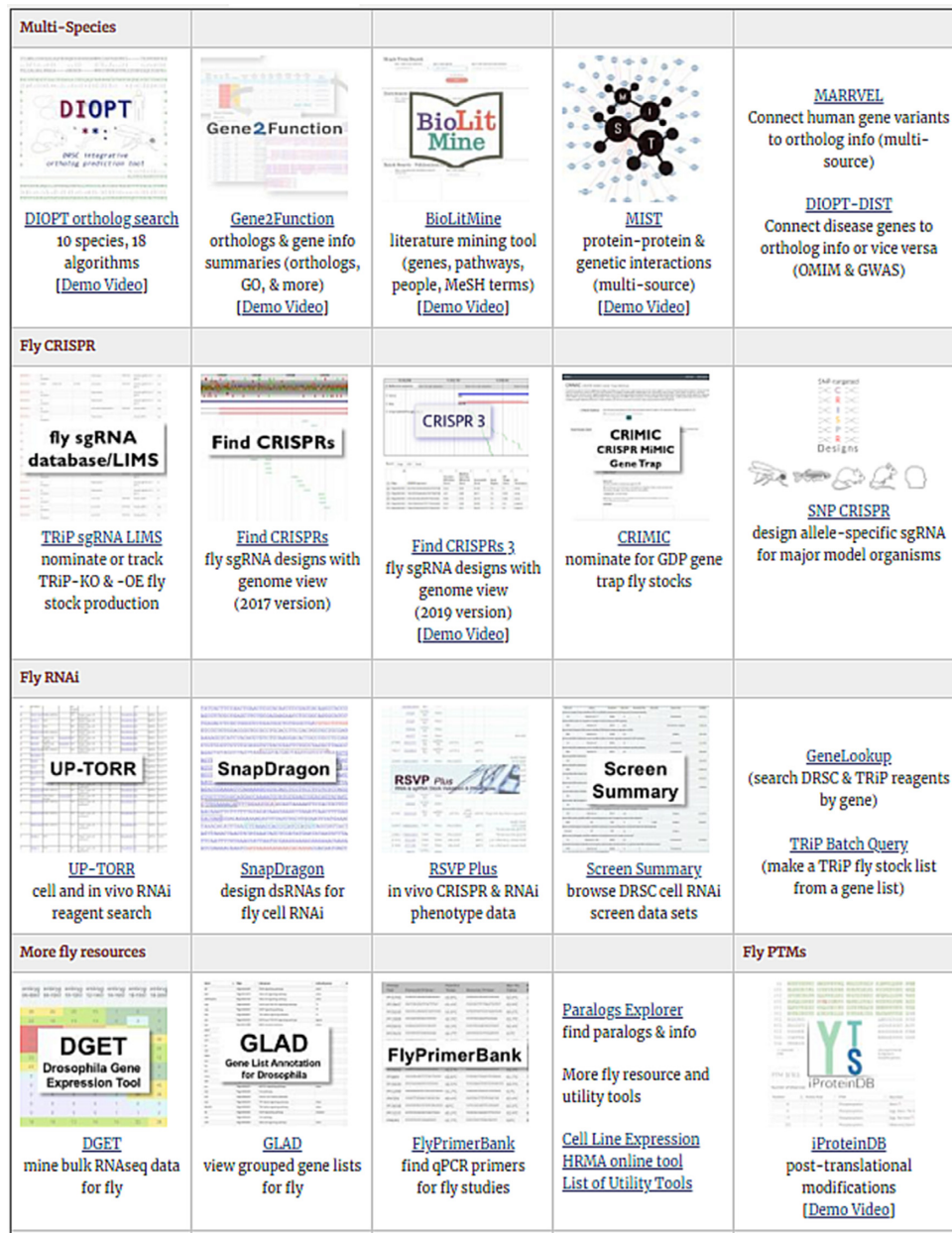
Figure 1. New look of the DRSC/TRiP online tools landing page.

In 2013, we made available our first-generation CRISPR single guide RNA (sgRNA) design resource for Drosophila , Find CRISPRs (18), a searchable database of pre-computed sgRNA designs that includes a genome browser-based user interface. In 2015, we replaced the original tool with an improved version incorporating efficiency prediction scores based on in-house Drosophila data (18,19) with the same style of genome browser-based user interface (currently referred to as the ‘2017’ version, reflecting the last update). A limitation of these first two versions of the resource is that users can only query one gene at a time and have to click through all sgRNA designs to find an optimal design. More recently, we launched Find CRISPRs 3, the third version of the resource (currently referred to as the ‘2019’ version, re-