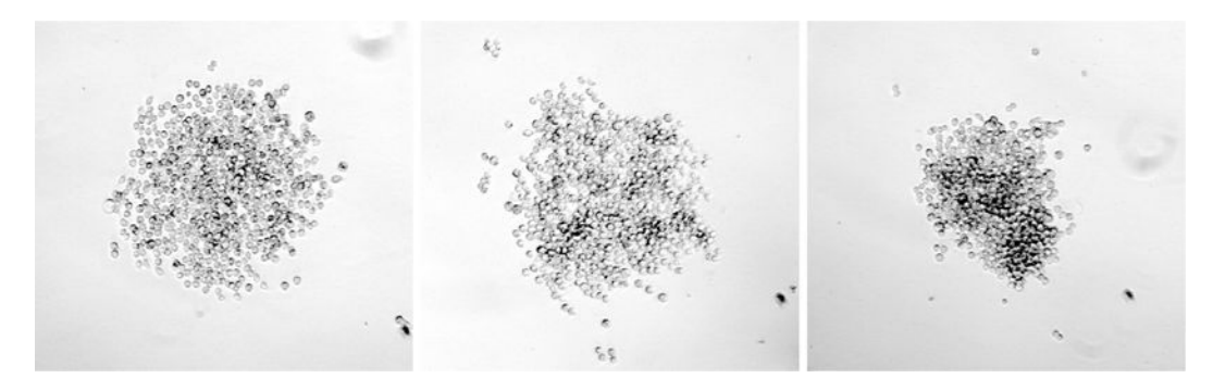
Figure 2. Examples of suitable colonies for expansion and sequence analysis